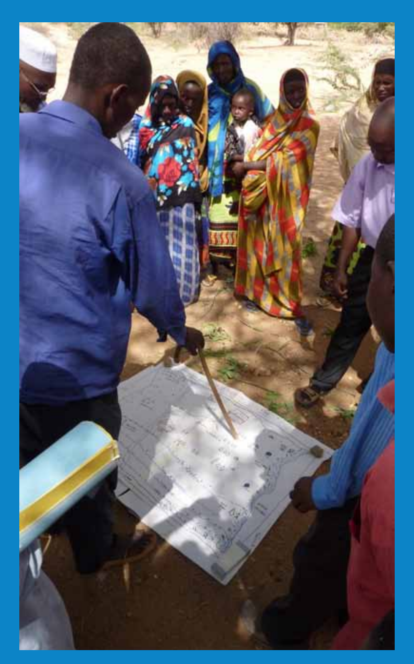
A PHAST training.