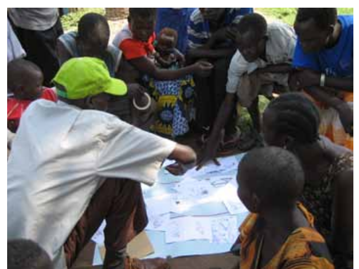
Community members engaging in the "Good and Bad Hygiene Behaviors" activity.

A community planning group should be selected to represent development of a new water scheme, rehabilitate an old scheme or expand an existing scheme. Project staff need to determine, based on local realities, the ratio of planning groups to numbers of households. Think about how many households the planning group might need to share its plan with, discuss details of the plan (such as setting tariffs), and obtain their support and consent. Thus it is difficult to imagine a planning group of 30 doing this planning for 1000 households. Based on experience, a suggested rule of thumb is that one planning group of 24 people should represent about 100 households, but this really needs to be determined locally and based on good logic for the project area.