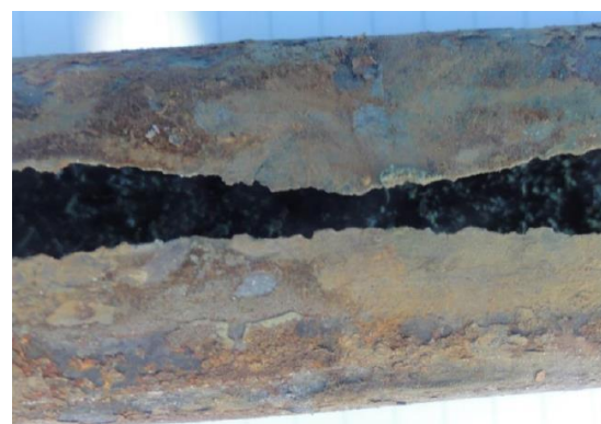
Photograph 2. Perforation of a rising main from corrosion