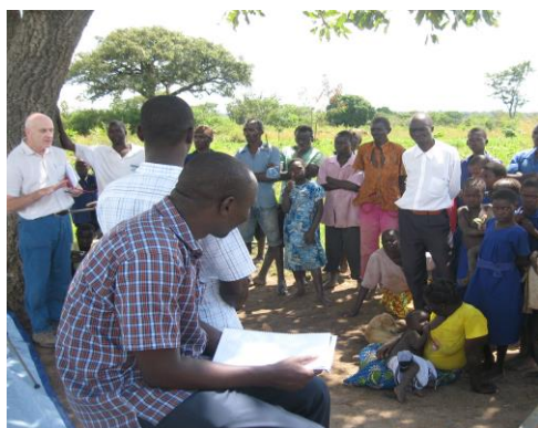
Photograph 1. Well point community discussions in Amuria District