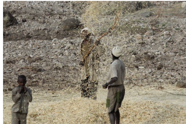
Ethiopian farmers where agriculture is the foundation of the country's economy and makes up a significant portion of the country's GDP.