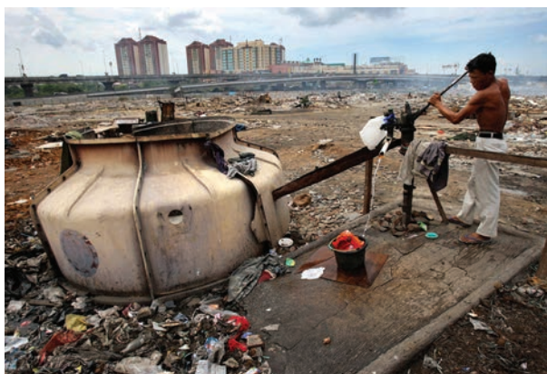
Innovative strategies need to be designed for special areas such as endangered coasts, mangrove ecosystems, and wetlands.