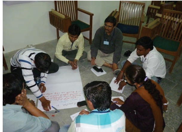
IWRM solutions can be found by using gender-sensitive participatory methods for project management and policy development.

▶ Lip service and no budget. When gender is included in plans of governments and of development programmes, the budget is usually too small to implement the activities. This leads to minimal actual work and no positive impact on poor women and men.