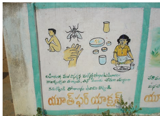
Access to safe, clean water, improved sanitation and good hygiene enables women and girls to take control of their lives.