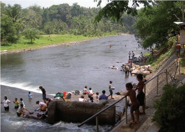
Mindanao river – used for washing, bathing and recreational activities.