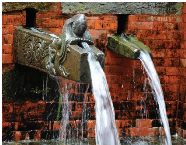
Cultural beliefs and values attached to water sources can help to protect them from contamination.