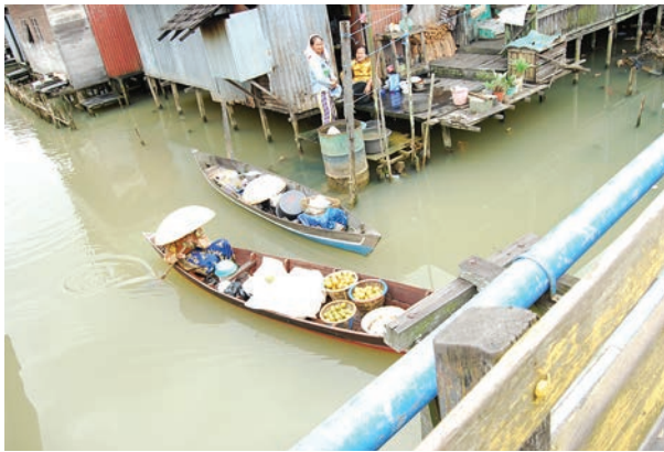
Greater protection for vulnerable people in the face of droughts or floods is important for protecting livelihoods.