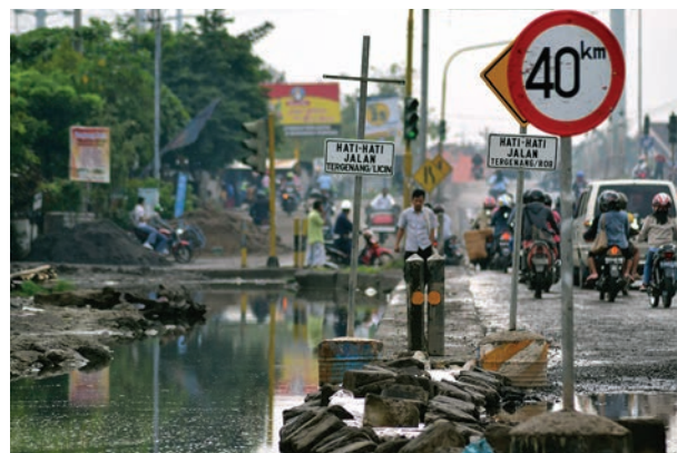
Urban dwellers living in poverty, in poor or informal settlements without basic infrastructure and services are often at the greatest risk from flooding.

Gender-sensitive adaptation requires an understanding of existing gender inequalities, and of the ways in which climate change can exacerbate these inequalities. Conversely, it also requires an understanding of the adaptation patterns in which