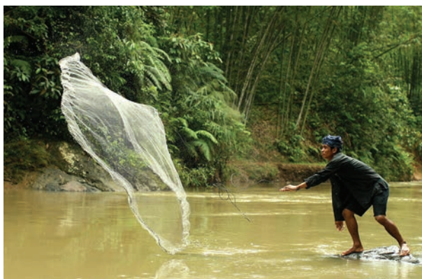
The livelihoods of poor men and women depend upon environments that are regenerative and support life.

At a global level, job losses in some sectors, and the rising costs of food and fuel have increased inequalities and lowered standards of living for those who depend on the natural environment for their livelihoods. Women and children are particularly vulnerable, especially in Africa. Poor people are often forced to adopt coping strategies that over-exploit the environment (e.g. overfishing in protected waters, unsustainable cropping practices that lead to soil erosion).