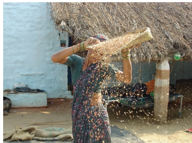
Crop insurance schemes for women farmers will help to protect and promote safeguards against the effects of financial crisis, climate change impacts and natural disasters on crop cultivation.