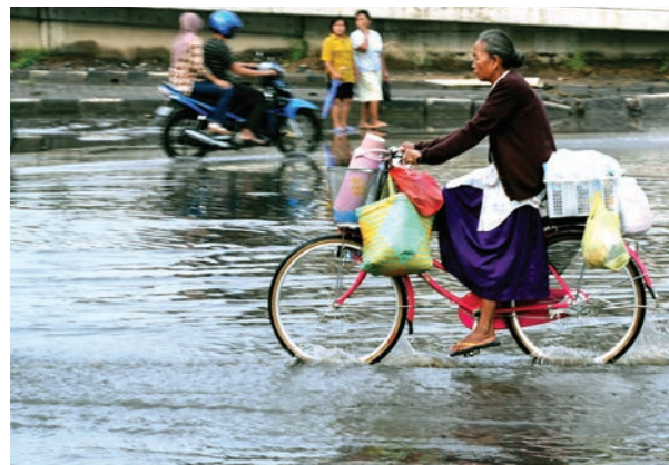
Flash floods, water logging/inundation and limitations on freshwater resources, due to extreme weather events affects the availability of water for domestic and productive tasks.

Variations in precipitation, sea level rise and temperature rises are intensifying the hydrological cycle around the globe, giving rise to extreme weather events and exacerbating salinity ingress into both water and soil. This in turn leads to flash floods and waterlogging, and impacts freshwater resources, reducing the availability of water for