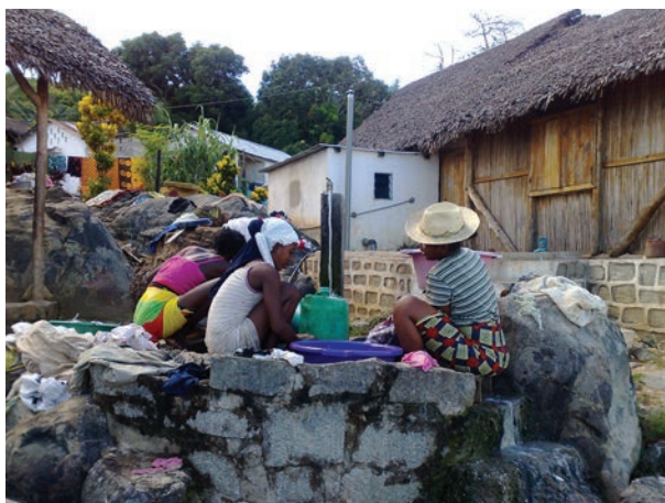
Gender sensitive budgeting in water sector programmes can create better access to water for local communities.