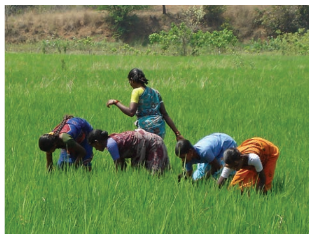
Although women and men perform complementary roles in agricultural systems, their tasks are often determined by their gendered roles.