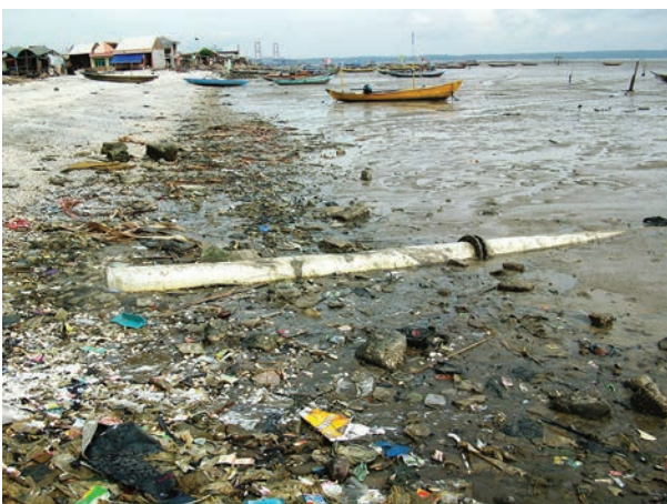
Many ecosystems are endangered by human activity, reducing the capacity of the environment to support life.

Ecosystems suffer wide and often irreversible changes when water is in short supply, or of poor quality, creating conditions that reduce their natural ability to purify, store and generate water.