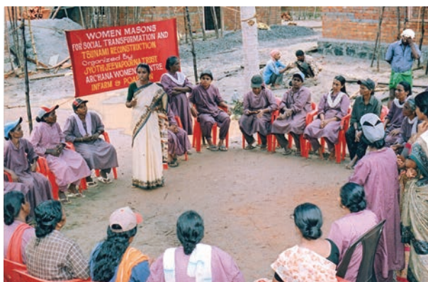
Technical and managerial staff, who are trained in gender and participatory approaches can help achieve more effective water and sanitation services.