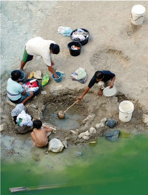
Women's knowledge of alternate ways to access water for domestic use should be taken into account when designing water projects and services.