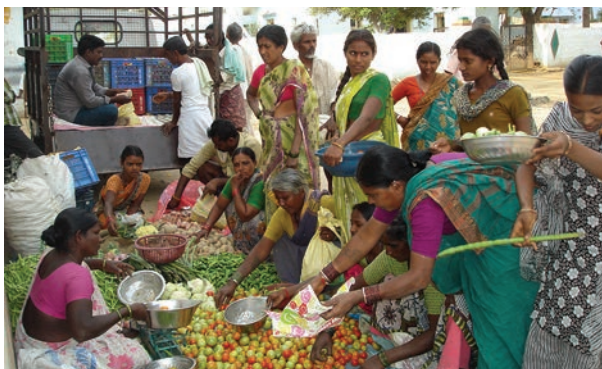
Financial incentive packages in line with IWRM principles can help protect livelihoods.