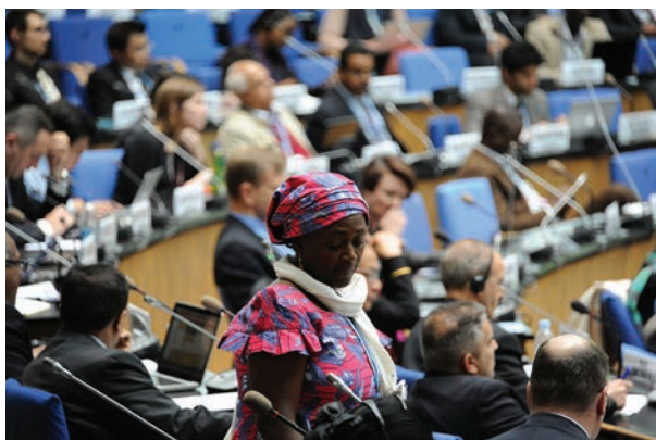
Women participating in UNFCCC-talks.