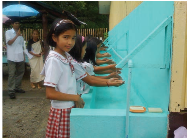
Hygiene education becomes more meaningful when sanitation facilities are in place.